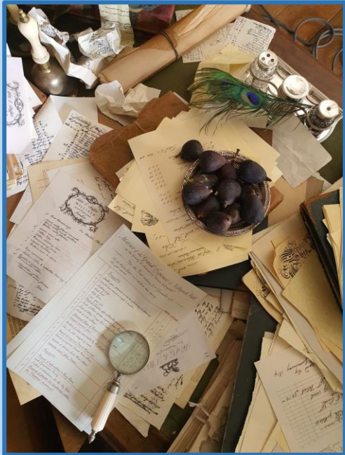
Kellynch Hall at Trafalgar Park