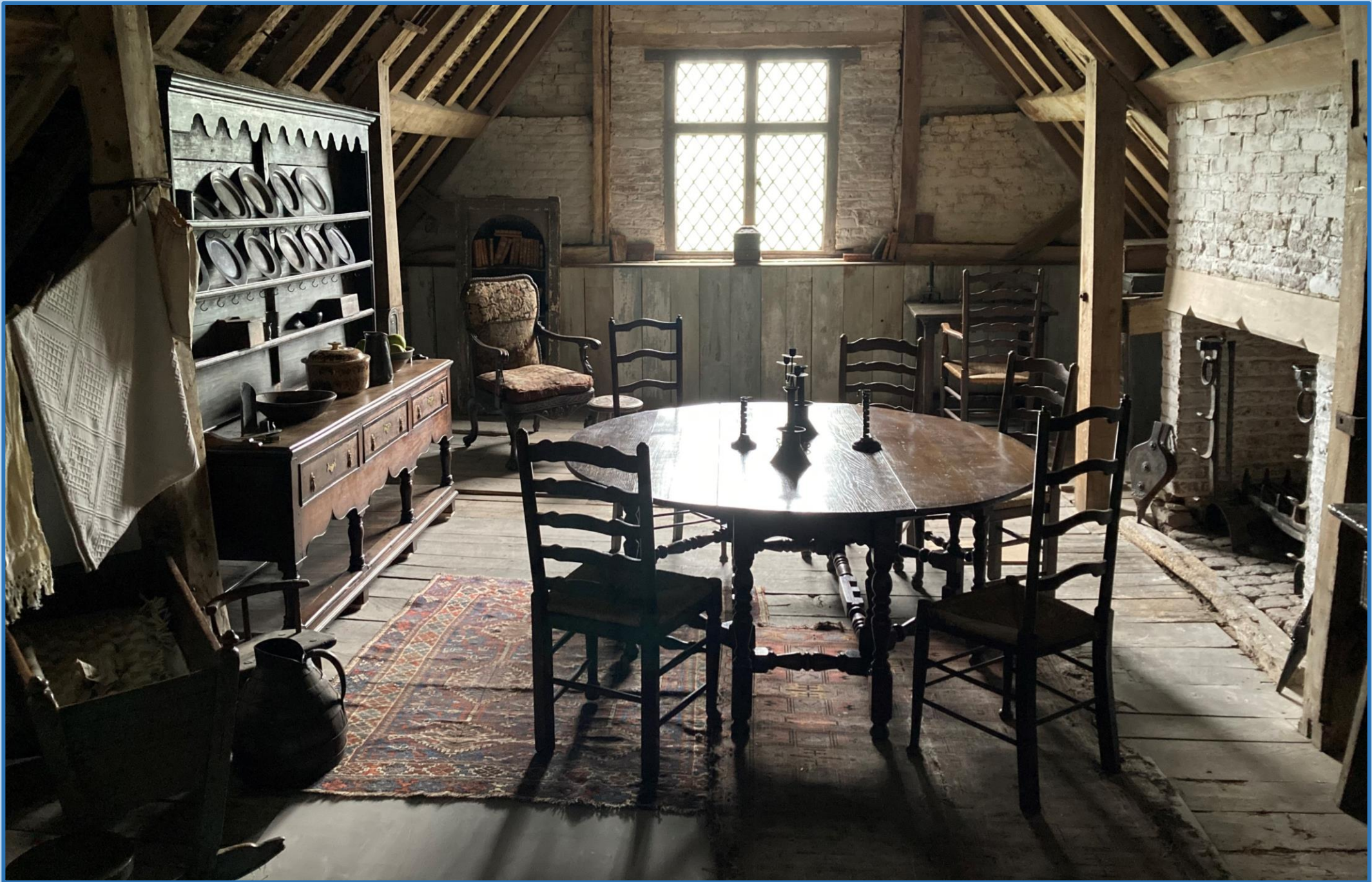
Harville House at Chenies Manor