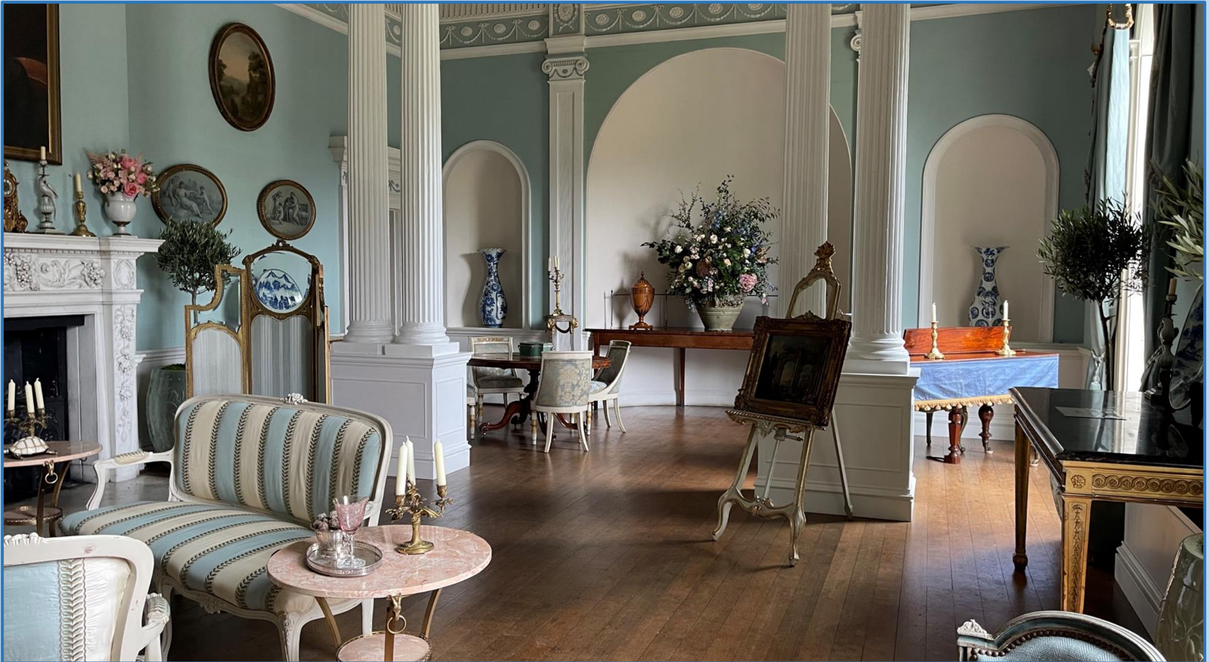
Camden Place at Amerdown House