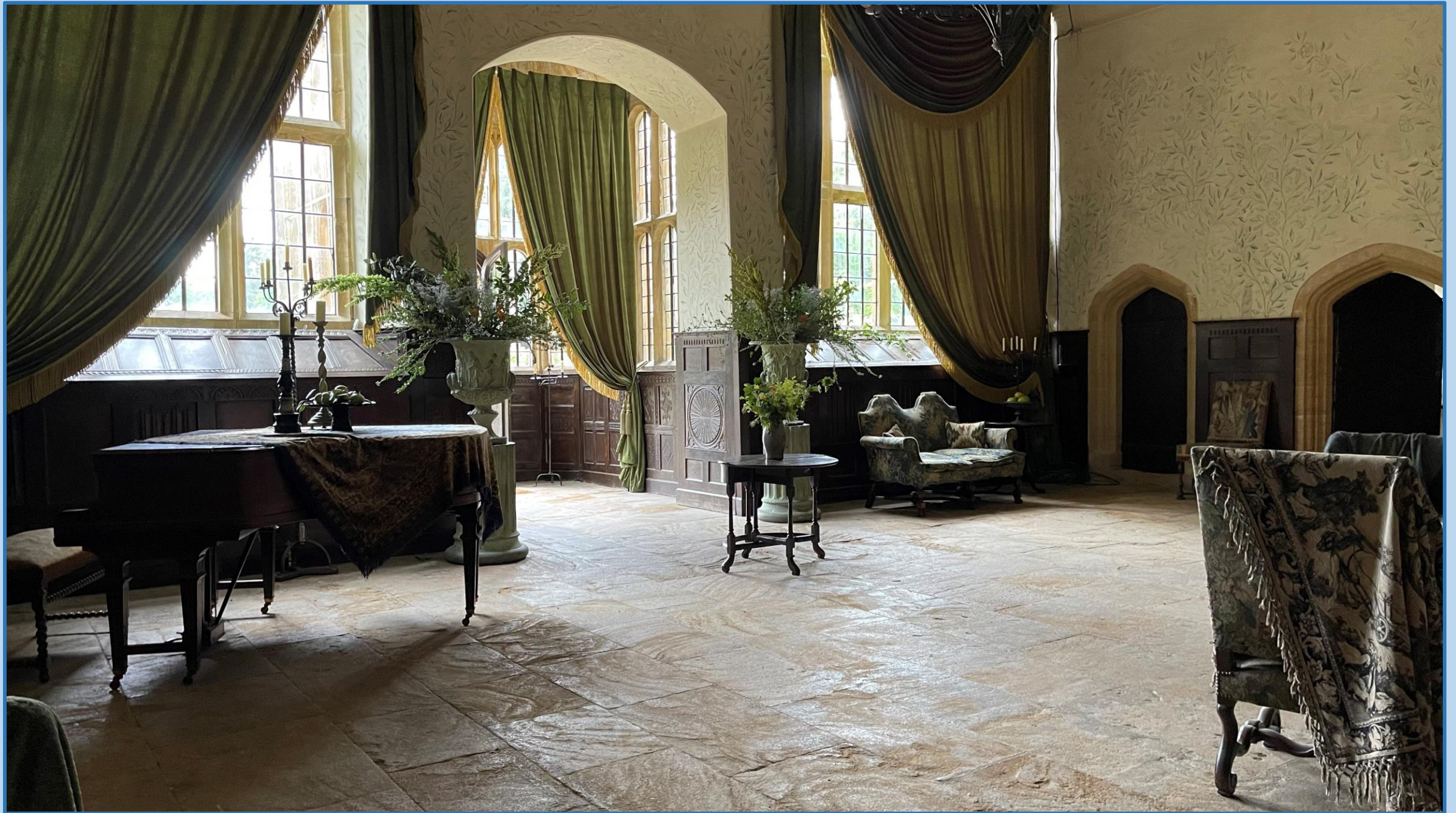
Uppercross House at Brympton D'Evercy