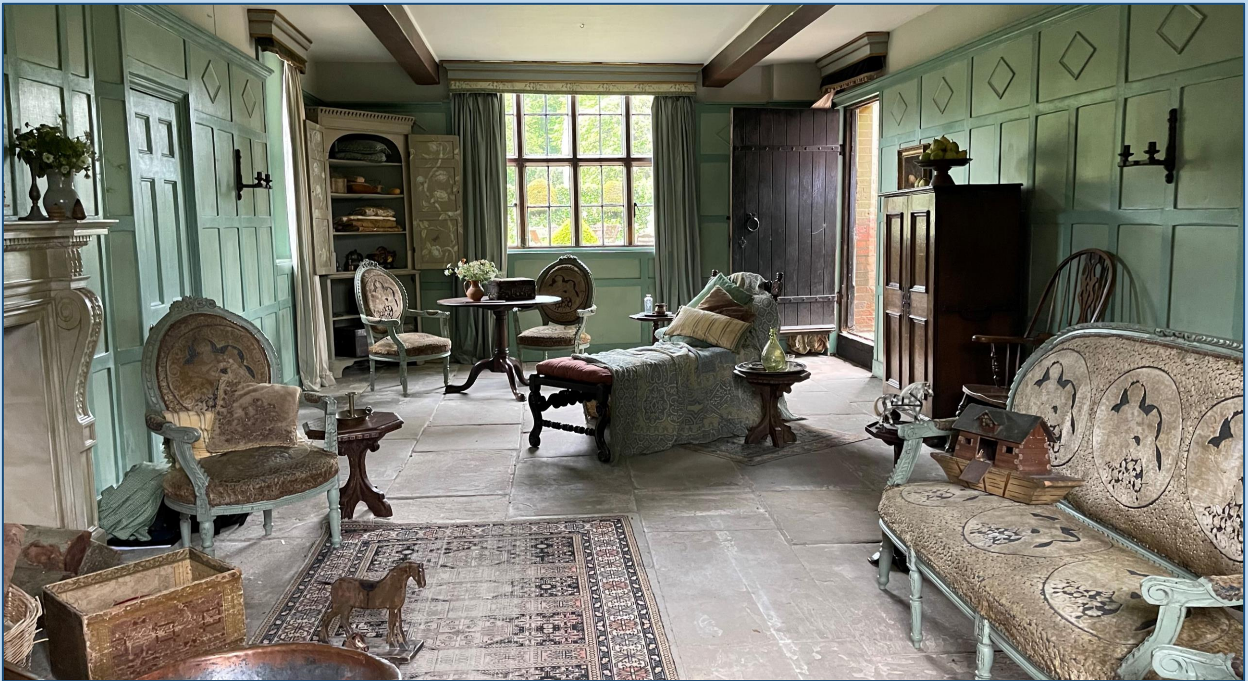
Uppercross Cottage at Chenies Manor