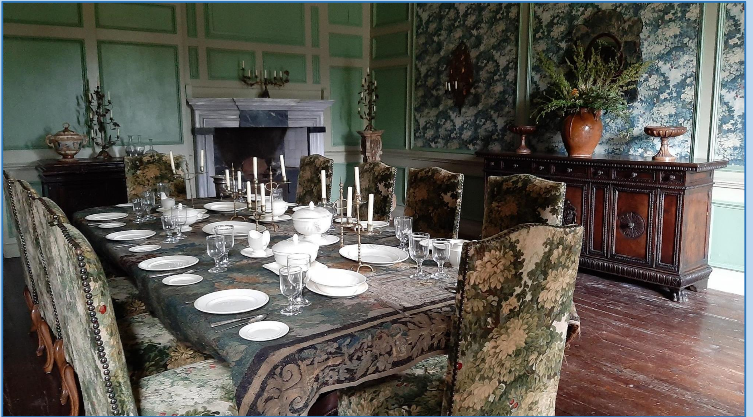
Uppercross House at Brympton D'Evercy