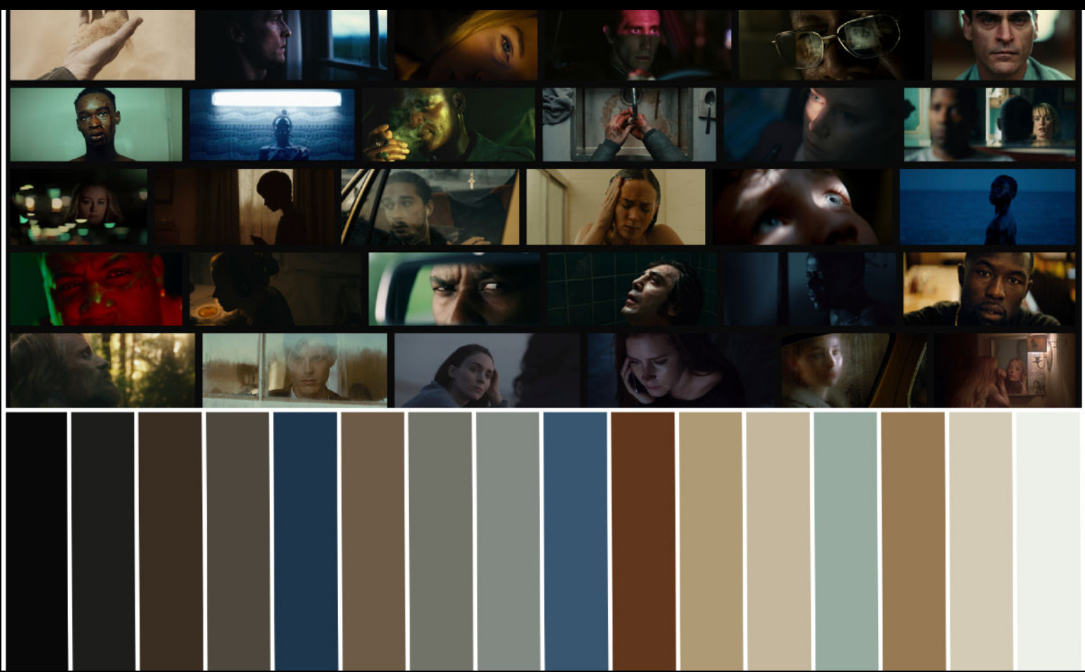
COLOUR PALETTE FOR CATCH ME A KILLER EP 1,2