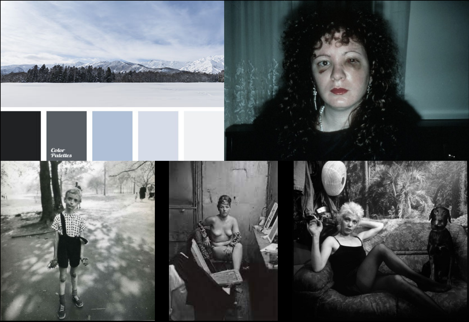
COLOUR PALETTE FOR CATCH ME A KILLER EP 8,9