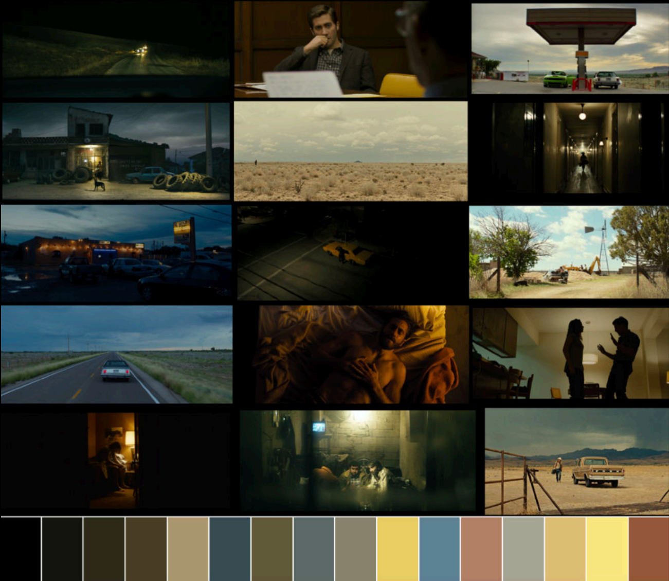
COLOUR PALETTE FOR CATCH ME A KILLER EP 10