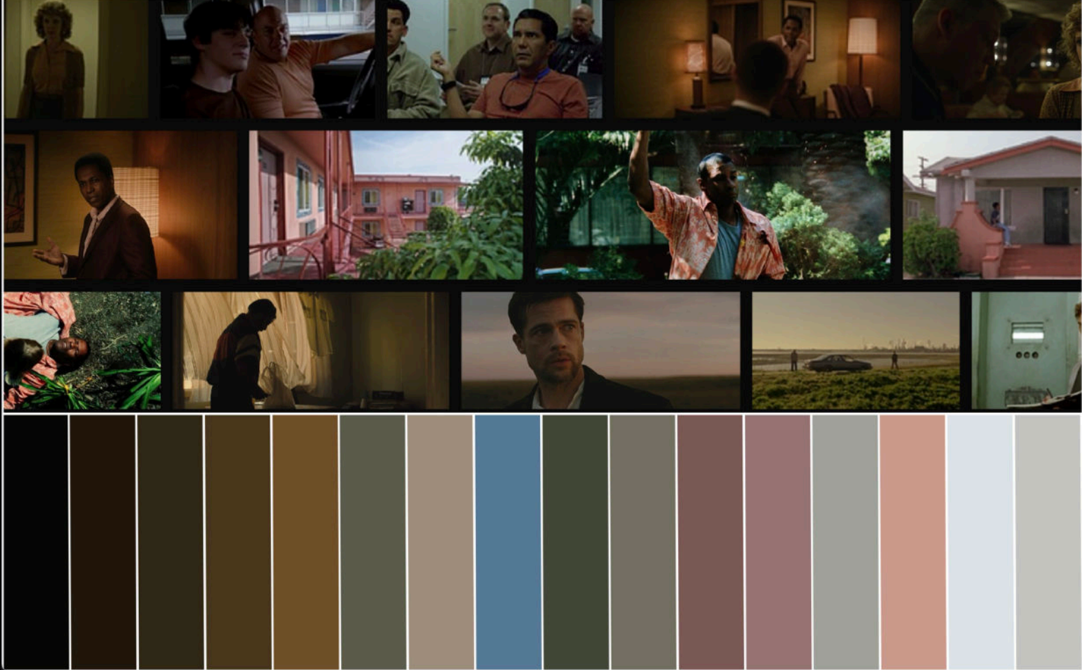
COLOUR PALETTE FOR CATCH ME A KILLER EP 3,4