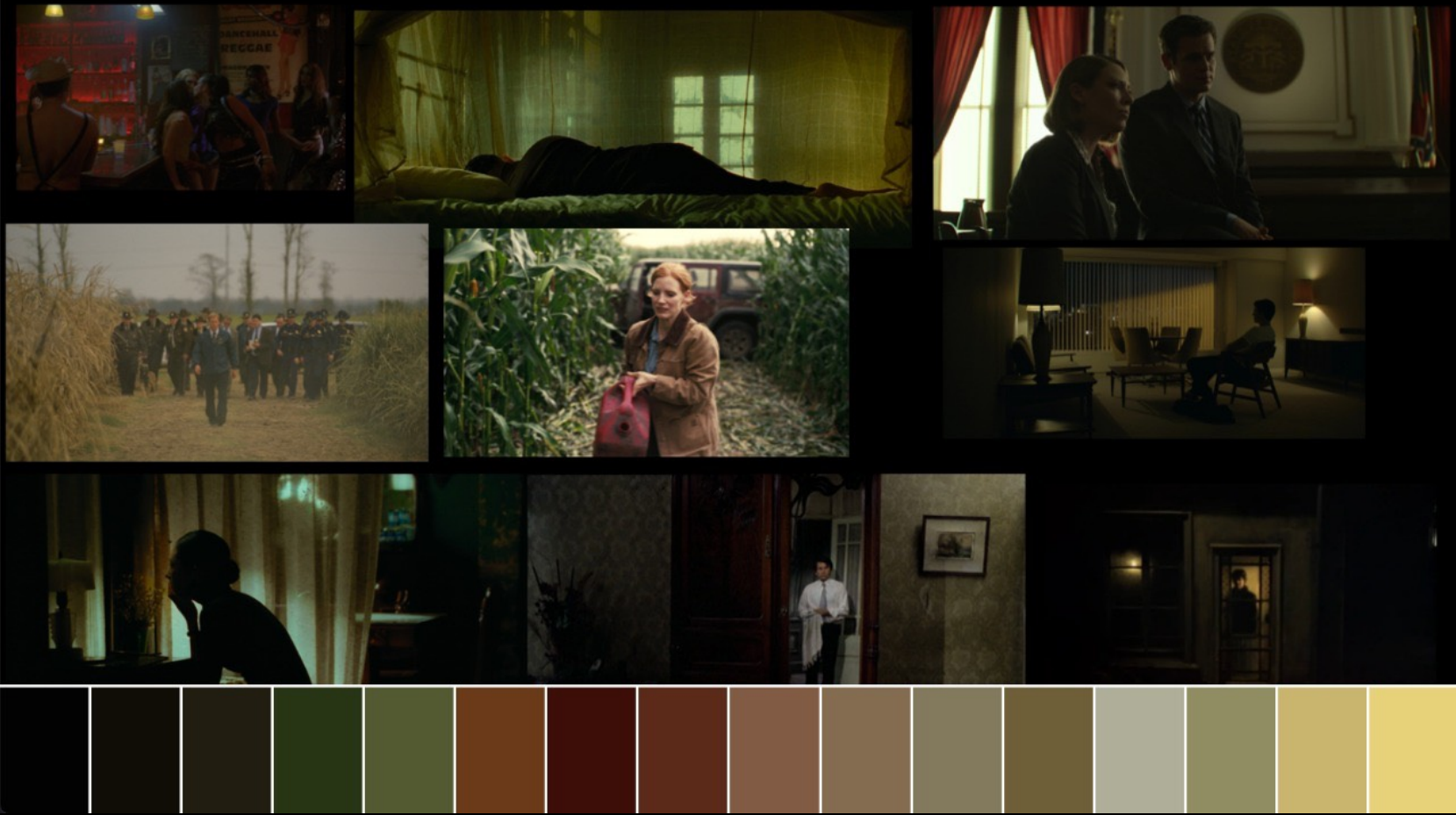
COLOUR PALETTE FOR CATCH ME A KILLER EP 8,9