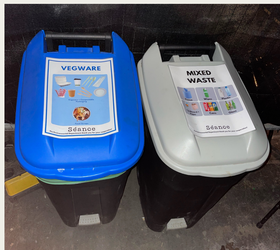
Bins on set at Pinewood Studios