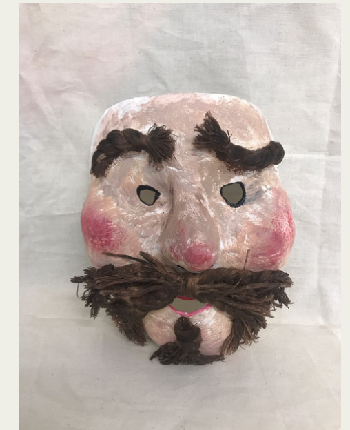
Examples of halloween mask and headdress made from Costume Department fabric and other material scraps.