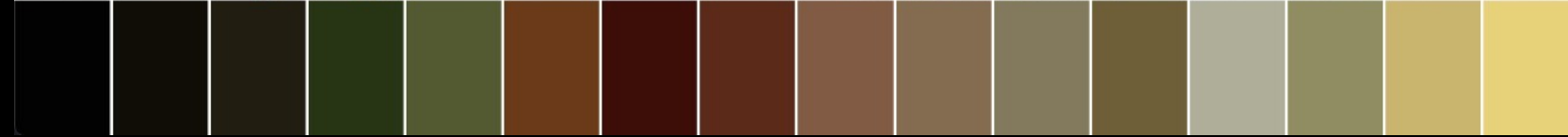
COLOUR PALETTE FOR CATCH ME A KILLER EP 8,9