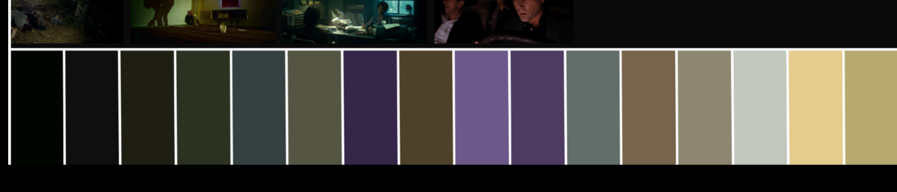
COLOUR PALETTE FOR CATCH ME A KILLER EP 5,7