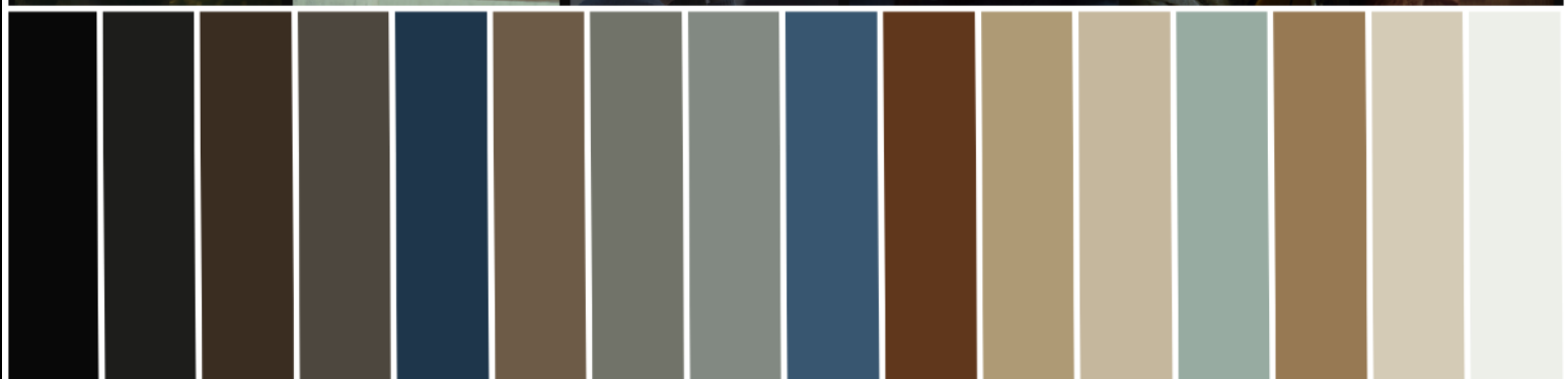
COLOUR PALETTE FOR CATCH ME A KILLER EP 1,2