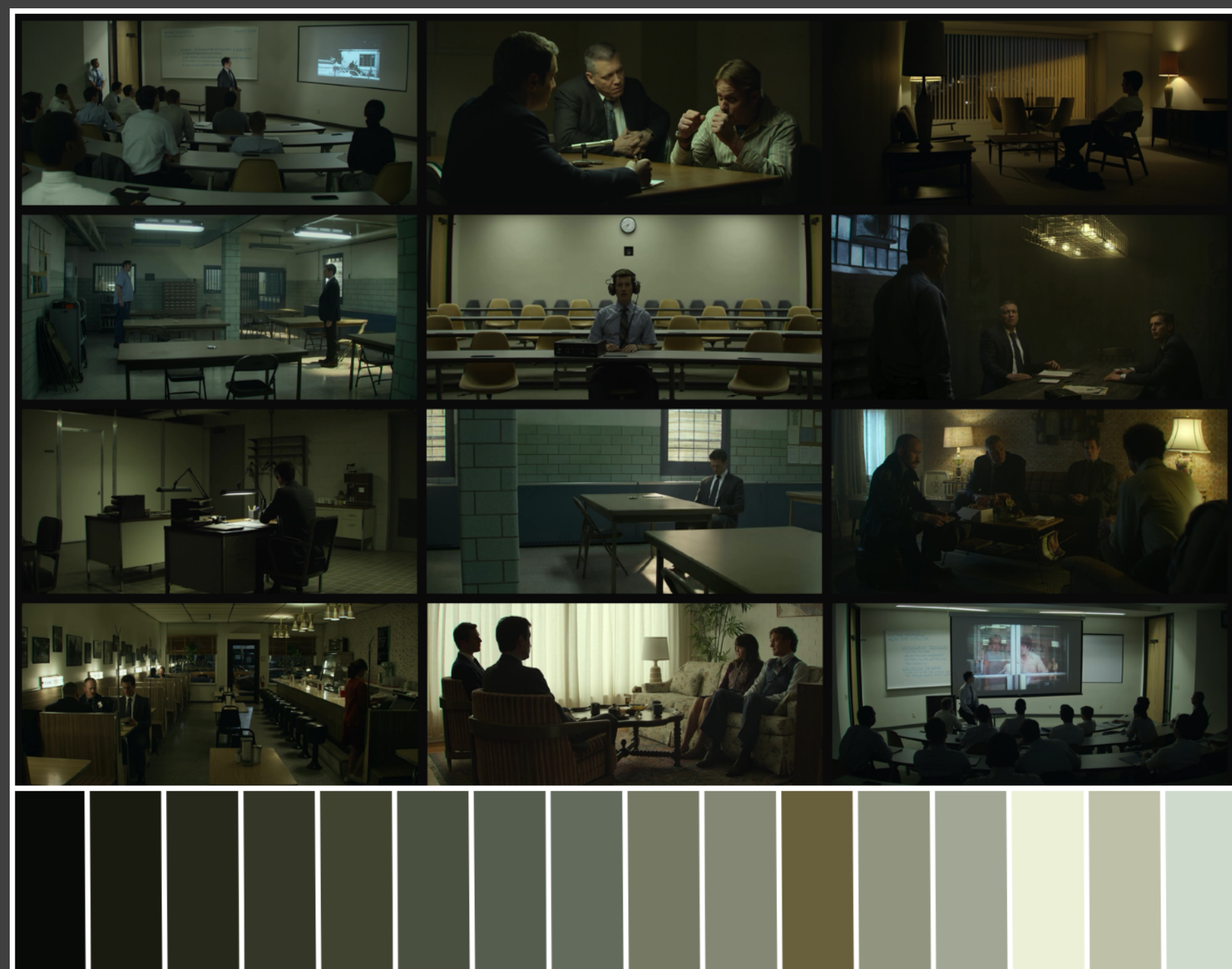
COLOUR PALETTE BASE COLOUR - CATCH ME A KILLER

Challenges : This was a period show that was shot in multiple parts of south africa that had different landscapes and vegetation. Each murder and robbery department had to look different but fit within a colour palette . This was achieved through paint and colour , fabrics furniture and period cars. All the crimes were true stories and as the production designer I was able to visit the archives of the Police department and recreate each scene in detail to the actual crime scenes as well as having direct contact with Micki Pistorius in order to get the details correct for each murder case.