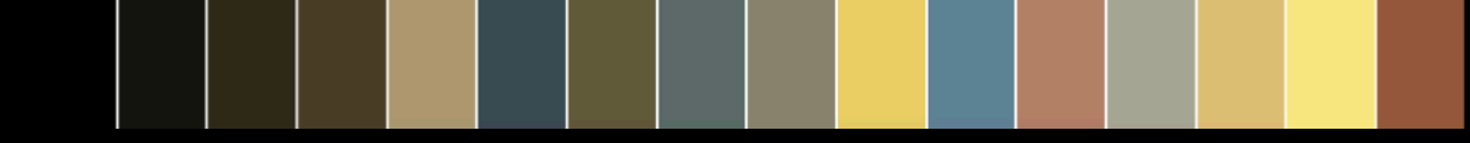
COLOUR PALETTE FOR CATCH ME A KILLER EP 10