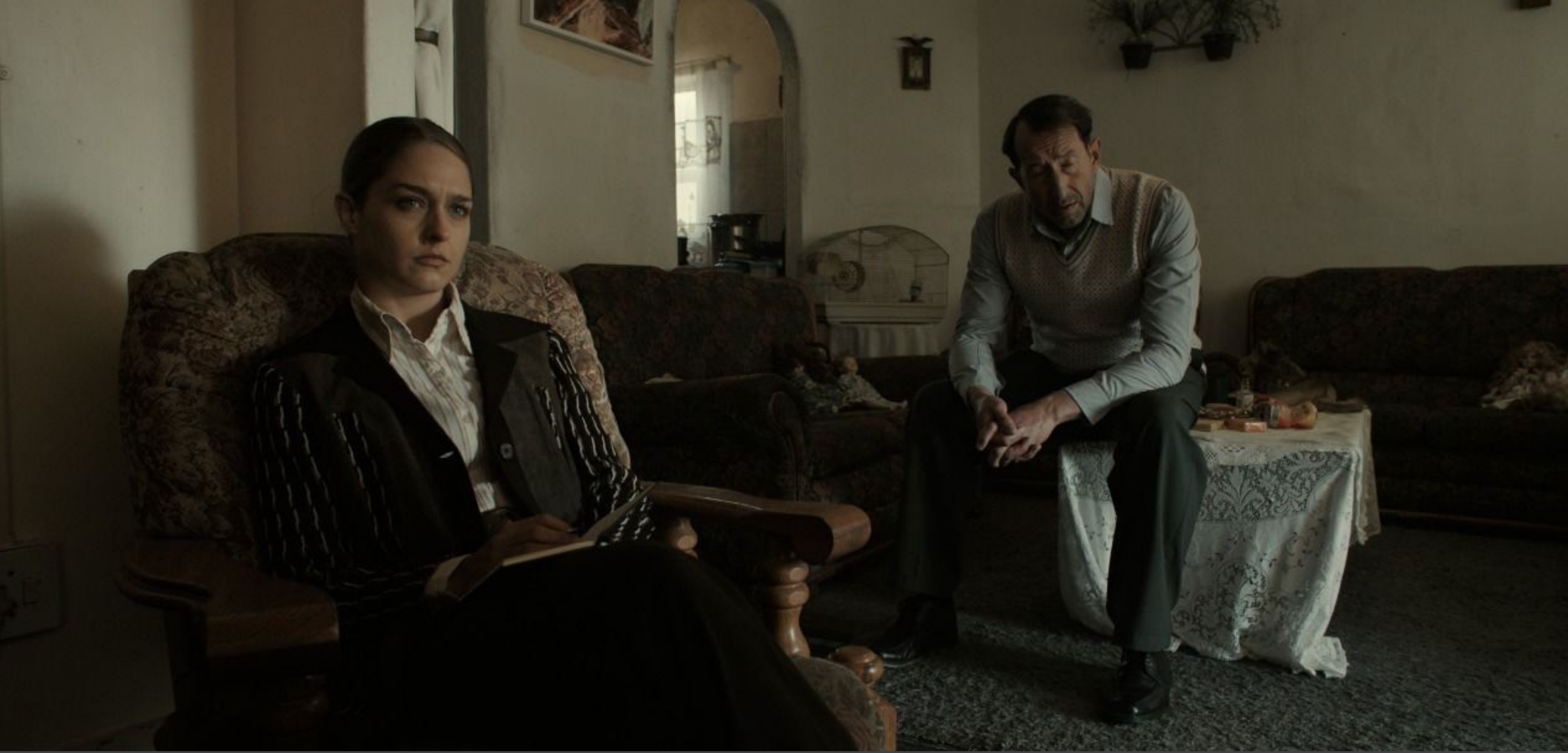
CMAK EP6 STILL- DETECTIVE VISITING A 90'S INTERIOR HOME LOWER CLASS WHITE INTERIOR. 90 decor and furniture fills the interior space from floor to wall and the base colour palette