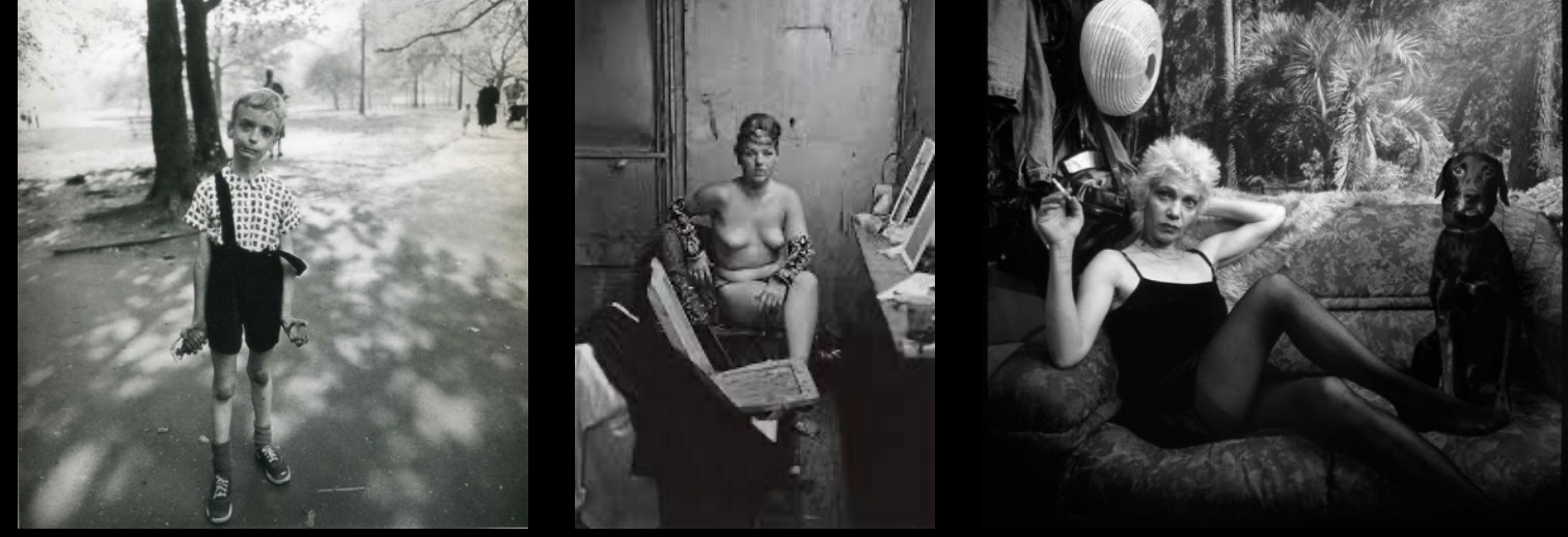
COLOUR PALETTE FOR CATCH ME A KILLER EP 8,9