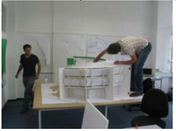
Building the 1:20 model of the Guggenheim

architecture rather than the three art dept courses from the film schools of Bablesberg, Cologne and Ludwigsburg in south Germany. Graduates of these go straight into the German film industry as designers of low-budget films. It is rare that a student of the Film School in Bablebserg for example, comes to ask for a job in one of the Art Depts of an international production.